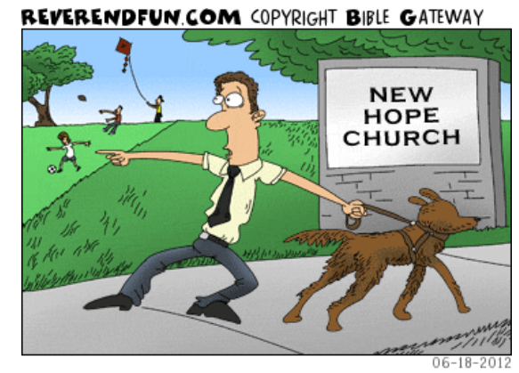
RUFF WAS A WHOLE DIFFERENT BREED OF GUIDE DOG

The next session of our Upper Zoom Book Study, exploring the book, White Fragility, will be on August 18th @ 7pm. This week we will be on chapters 8-9.